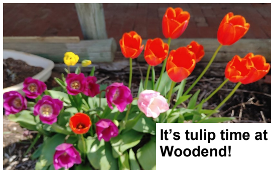
It's tulip time at Woodend!