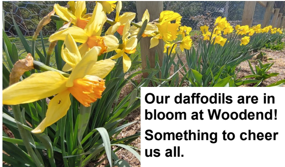
Our daffodils are in bloom at Woodend! Something to cheer us all.

Grant assured us that the new club would not have any political agenda, would not have any advocacy role and would work strictly within Rotary rules.