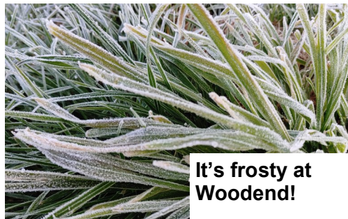
It's frosty at Woodend!

Who does Hope Springs support? A large proportion of clients are adults over 40 with diagnosed mental illness. Many are unemployed, living in a supported residential setting or patients from psych wards and supported rehabilitation programs. Another client group comprises community members living on their own. All up there are currently 110 people on the books.