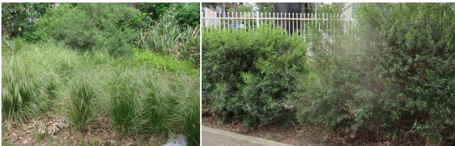
Chilean Needle Grass

Our Club executive has agreed to put together a working group to explore opportunities to muster input from the wider community to assist with this significant environmental improvement project.